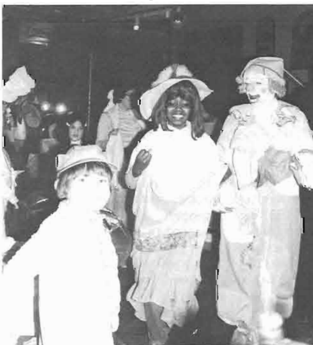
Posing for family portraits

It takes lots of imagination to imagine all that happened, but that's the art of the Imaginarium.