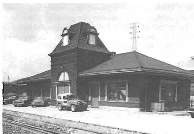
The Homestead Station may be adapted for reuse as a restaurant.

The Homestead Station, built in the center of town in 1912, now stands vacant. Its simple depot form, with its broadly overhanging hip roof, is highlighted by an eclectic tower. It has the potential to be adapted