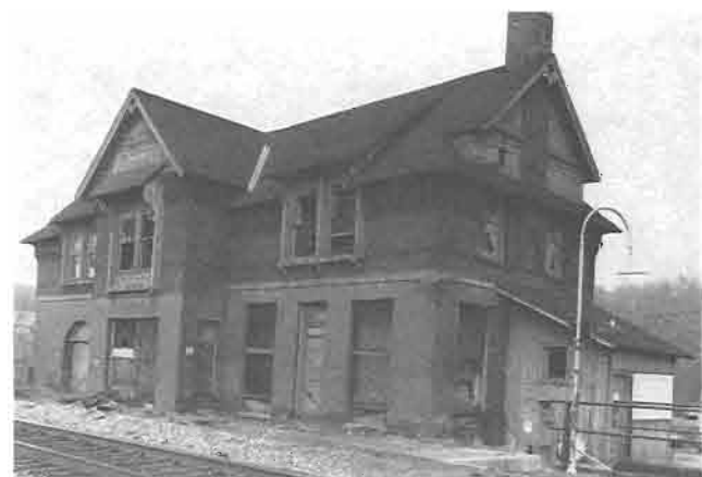
The Queen Anne Railroad Station in Emsworth is slated for demolition.

In Emsworth, the Queen Anne station is less conveniently located, sited at the edge of the Ohio River near the Emsworth Dam. After having served as a warehouse for years, the station is now abandoned and slated for demolition.