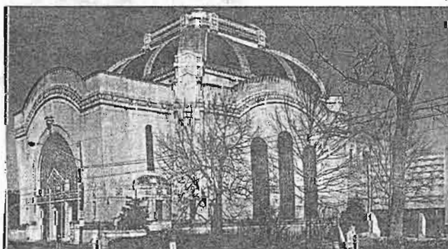
Rodef Shalom Congregation 4905 Fifth Avenue, Shadyside