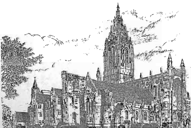
East Liberty Presbyterian Church Penn and Highland Malls

The months of December and January have special meaning for congregations of the Orthodox, Jewish and Christian faiths. You'll discover some of the religious traditions celebrated during these months on our Holiday Season Tour to St. George Orthodox Church, Rodef Shalom Congregation, and East Liberty Presbyterian Church.