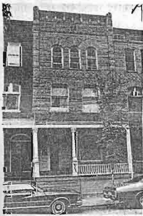
1219 Buena Vista Mexican War Streets

The 1300 block of Liverpool Street in Manchester constitutes the finest surviving Victorian street in Pittsburgh. 1330 Liverpool is a three-story row house which has been divided into two equally-sized apartments. Completely restored in 1977, the building has modern plumbing, wiring, bathroom fixtures and kitchen appliances. The exterior has been repointed and painted. Each apartment contains a living room, dining room-kitchen, two bedrooms, one bathroom and spacious storage. Much of the original interior detail work is intact. $65,000