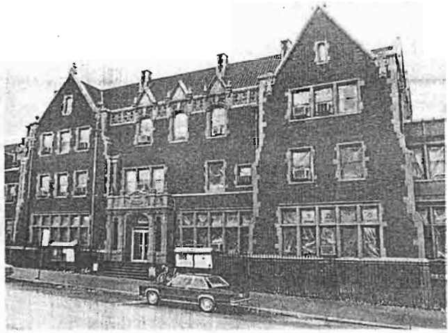
Jones Hall-- after restoration