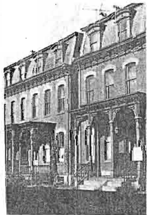
1330 Liverpool Street Manchester

We continue to offer some of our historic residential properties for sale. Some of these buildings are restored, some partially restored, and some awaiting restoration. In all cases, the buildings have architectural qualities and are part of one of our historic districts. We acquired these properties to help secure the neighborhood and initiate the program, but it is no longer necessary for PHLF to hold the properties and we are glad to make them available, generally below market costs. The prices are firm and do not include broker's commissions.