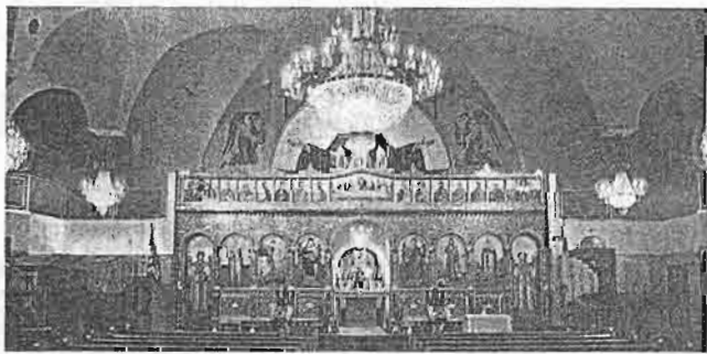
St. George Orthodox Church 3400 Dawson Street, Oakland