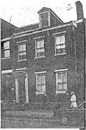
1238 Monterey Mexican War Streets

three occupied rental units, but can be adapted to a spacious owner-occupied unit on two floors plus a third-floor rental unit. $69,000