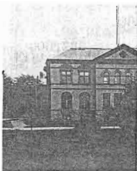
Andrew Carnegie Free Library, 300 Beechwood Avenue, Pittsburgh, PA 15212. Landmark I

The Andrew Carnegie Free Library was among the first libraries donated by steel entrepreneur Andrew Carnegie --and is the only one to carry his full name. During his lifetime, Carnegie donated $56,162,622 for the construction of 2,509 library buildings in the English-speaking world. Over 65 sites and districts in Allegheny County are recorded in the National Register.