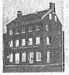
Traditional Customs House Before...and...After