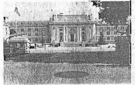
Bancroft Hall, Naval Academy