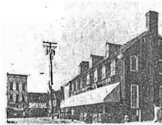
Waterfront, Annapolis Market Square