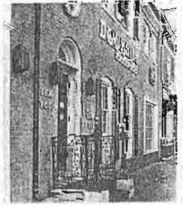
Restaurant, Annapolis Waterfront, Market Square