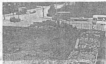
30,000 Belgian Block Were Dug out of Heaps of Dirt that had been dumped by the Trucks and were Stacked around the Perimeter of the Garden Court