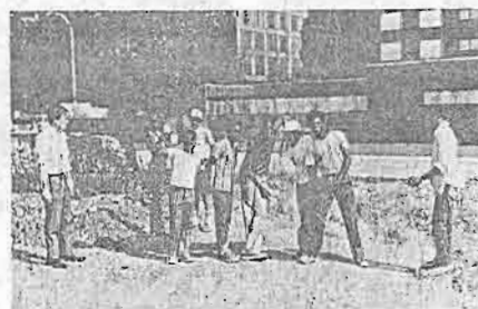
A Team of Neighborhood Boys Who Stacked Belgian Block

A long belgian block wall is being constructed along the western side of the court to separate the artifacts exhibition area from the Allegheny Center loop highway and provide a shelf for exhibiting special exterior artifacts. A smaller wall is being constructed to form a gateway be-