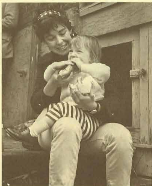
Time out for a busy little observer