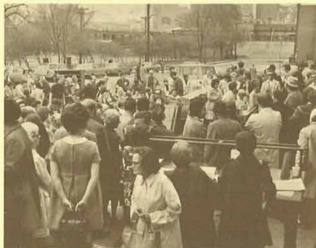
The large gathering at the sale

zesty bidding by the 200 persons who paid $1 for the privilege of participating. Shutters, stained glass, mantels, light fixtures, woodwork, and some handsome interior fittings of the old post office that will not be needed in the restoration work all went to the