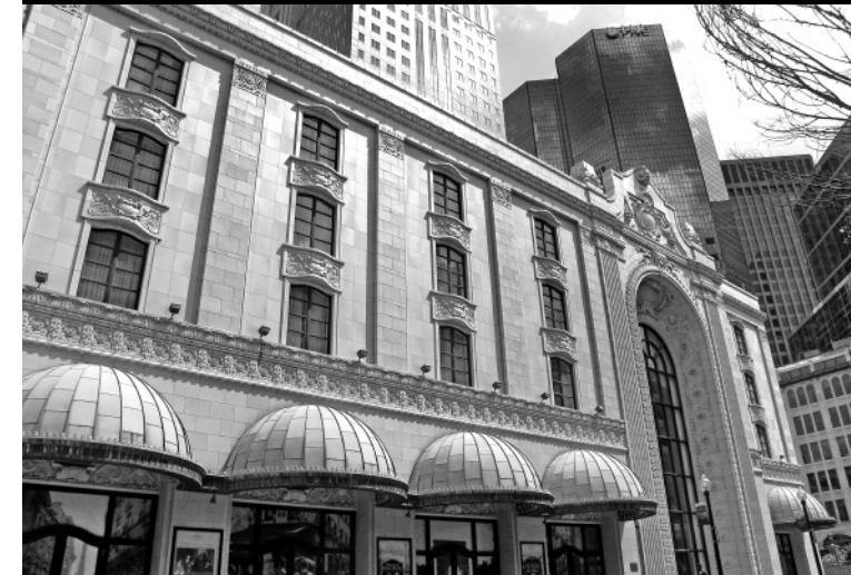
Heinz Hall is home to the world-famous Pittsburgh Symphony Orchestra.