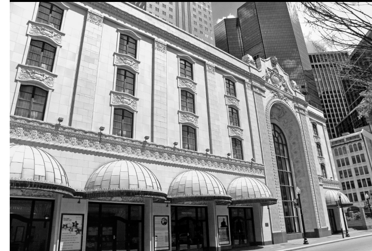
Heinz Hall, at 600 Penn Avenue, is the home of the Pittsburgh Symphony Orchestra. The PSO is celebrating its fortieth anniversary season at Heinz Hall (seen here from Sixth Street).